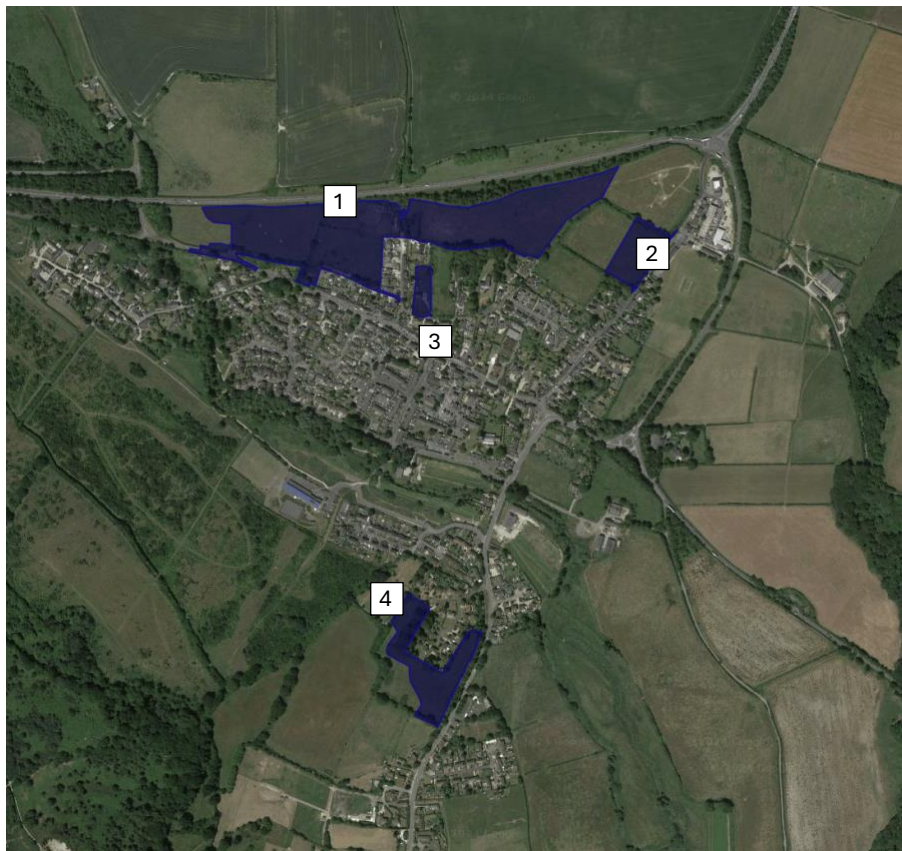
Figure 11: Planning Applications on Allocated Sites